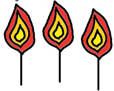
Tongues of Fire Stick Cookie

Roll out sugar cookie dough. Using a small knife, cut cookies into the shape of a flame of fire. Press a sucker stick into each flame. Bake according to cookie dough directions. After cookies cool, add frosting to color the flames.