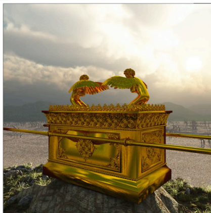
Ark of the Covenant