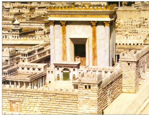
The Temple, Jerusalem!

How did God open your eyes to what needed to be corrected?